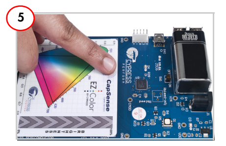
To put the board to "sleep" while powered, press and hold the circular emblem to the left of the CapSense logo.