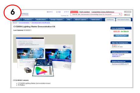
Check for kit updates on: http://www.cypress.com/go/CY3269N