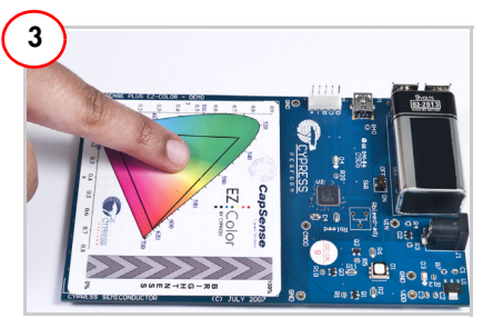
Tap the color gamut to view different colors from the RGB LED. Adjust the brightness using the slider available to the right of the gamut.