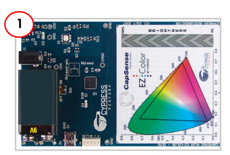
Remove the CY3269N kit from the package.