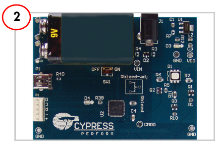
Insert the 9-V battery into the battery holder. Press firmly in place.